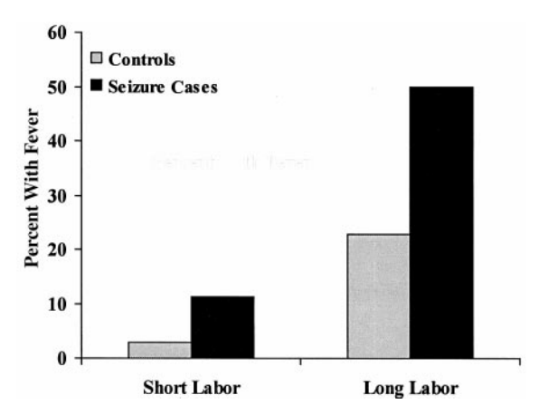
Fig 1. Proportion of case infants and controls with fever according to length of labor.

A conditional logistic regression analysis was performed to examine the association of fever with unexplained neonatal seizure while taking into account matching and controlling for the potentially con-